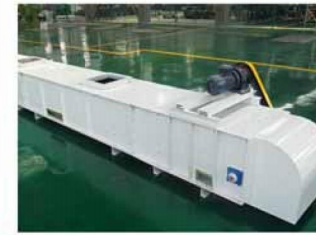
Enclosed Belt Conveyor