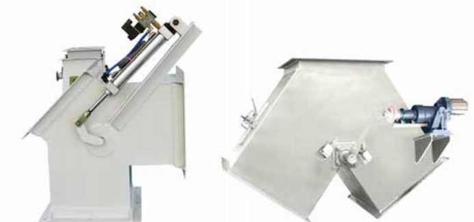
TBDQ Series Pneumatic three-way valve TBDD Series Electric three-way valve