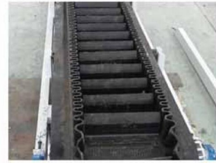
Skirt Belt Conveyor