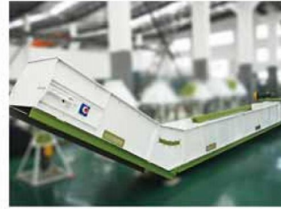
Bevel Belt Conveyor